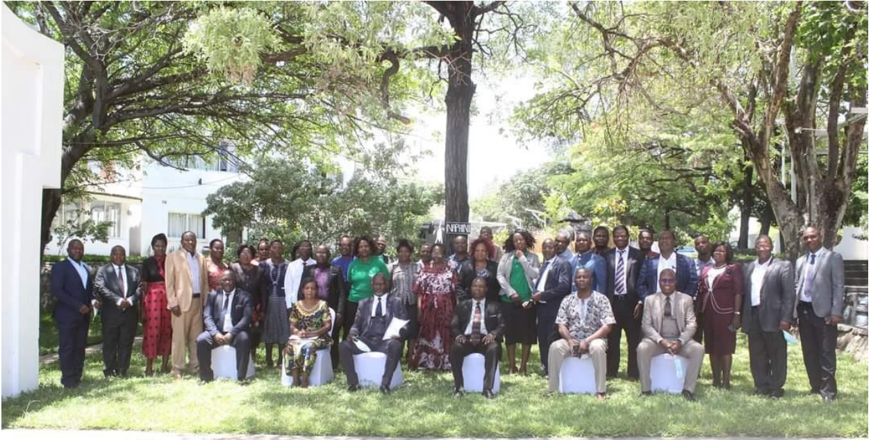
Group photo of the delegates to the launch of the MASSHA Constitution