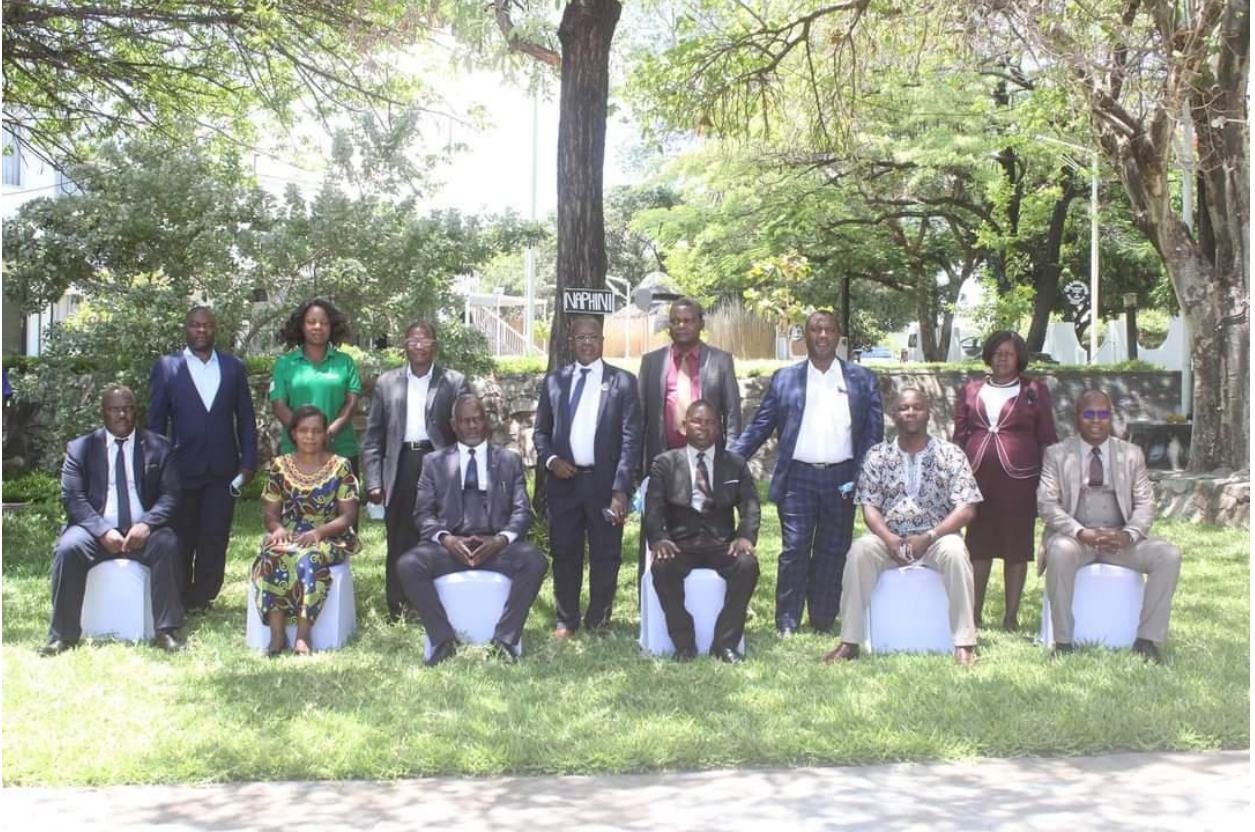
MoE officials posing with the new MASSHA NEC